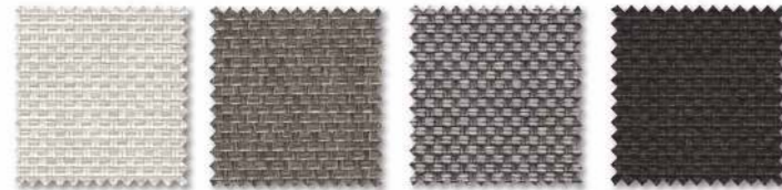
WHITE 410 BROWN GREY 427 GREY 435 ANTHRACITE 445

Crevin is a unique upholstery fabric for joint indoor outdoor use. It has a homely and natural appearance and can be easily cleaned by domestic machine-wash. It is finished with stain repellence. Sofa cushions are filled with Dryfeel® all weather foam.