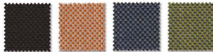
BLACK 450 ORANGE 424 DARK BLUE 479 GREEN 480