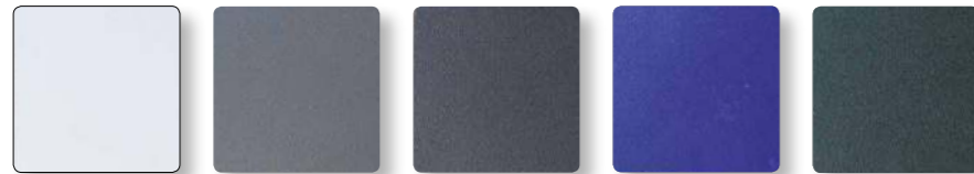
WHITE 110 GREY 105 ANTHRACITE 145 BLUE 175 DARK GREEN 180

100% polyester is used for powder coating.