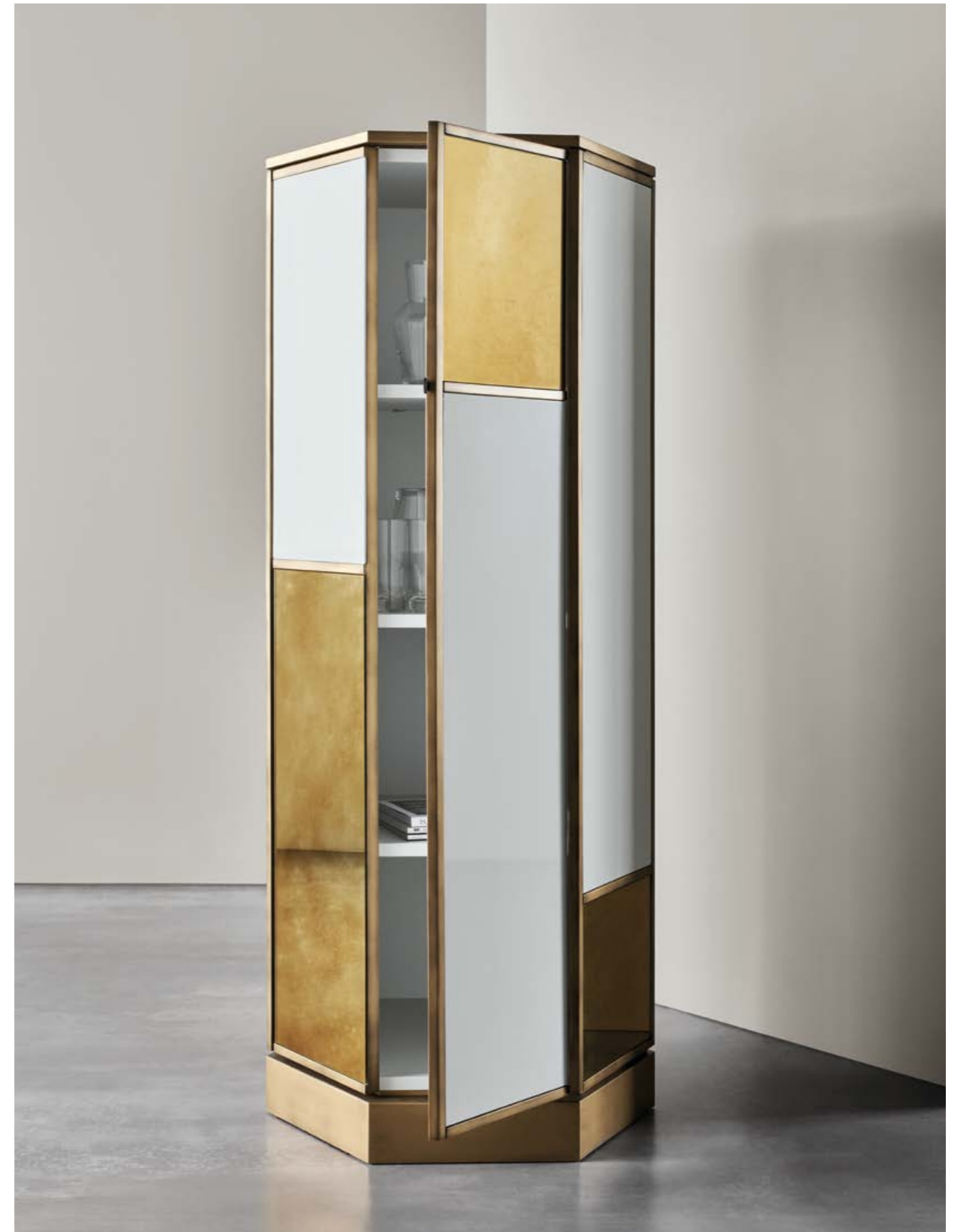
P. 231 LUDWIG madia . cabinet