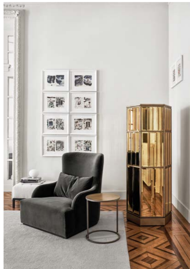
LUDWIG DIAMOND madia . cabinet LIU SKIN bergère PEK tavolo basso . low table